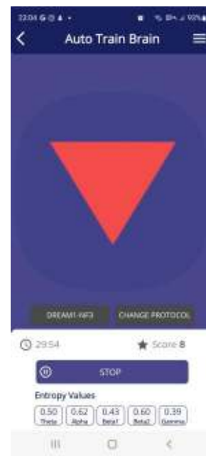
Figure -1 Auto Train Brain "arrow" interface

In the future, we will repeat the experiment with more participants. There may be a placebo effect and maturation effect in the experiments.